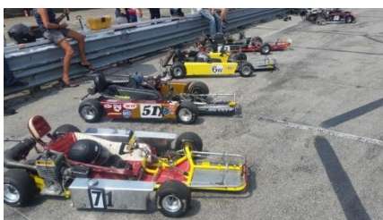
Vintage Piston Ports on the Grid