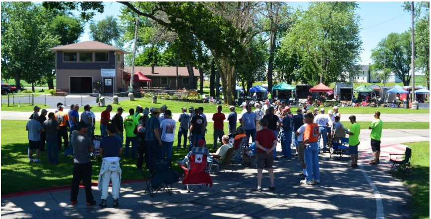
In-the-pits at Brodhead

The “always welcome” wine/cheese/beer tasting was held during the Kart Show ... and enjoyed by all.