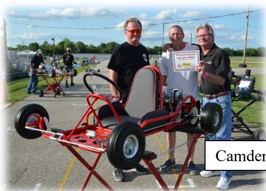
Camden: Peoples' Choice