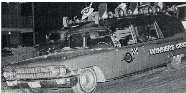
The famous Goodyear Family converted a hearse into a kart hauler.