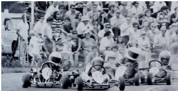
Rookie Class Action

The American Junior class was the largest with 75 entrants.