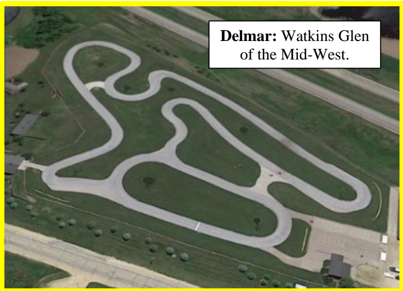
Delmar: Watkins Glen of the Mid-West.